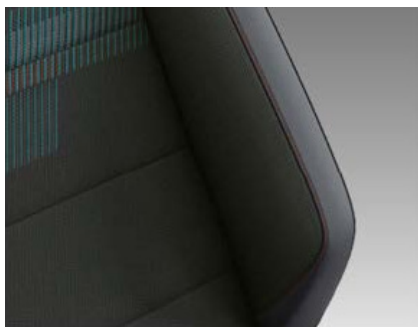
"Diag" (Design Pack Bamboo Garden) Makena Turquoise - Orange/Platinum Grey Cloth (DL) Optional on Style & R-Line