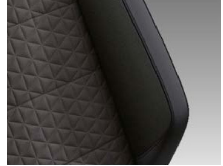
"Hexalink" Cloth Pearl Grey (FL) Standard on Style & R-Line