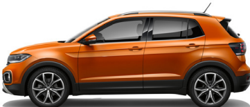
Energetic Orange Metallic * 4M4M