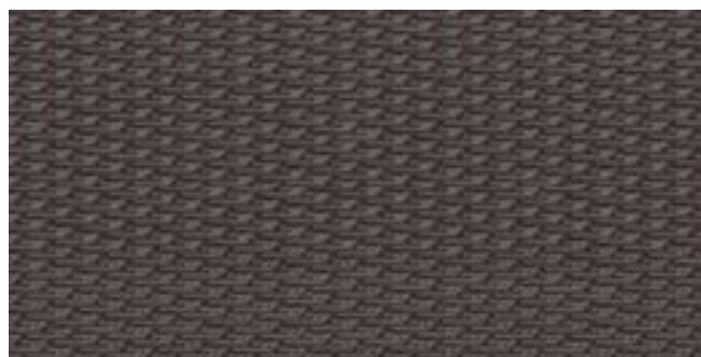
Race Optional on R-Line (R-Line Interior)