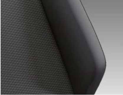
"Basket" Cloth Platinum Grey (EL) Standard on T-Cross