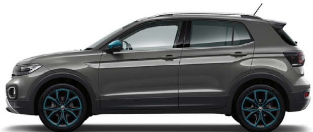
Design Pack: Bamboo Garden