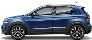
Reef Blue Metallic * 0A0A