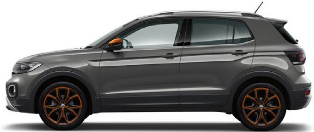
Design Pack: Energetic Orange