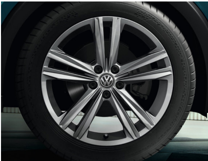
STANDARD ON R-LINE 17" Sebring alloy wheels 6.5J X 17 Tyres: 205/55 R17