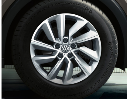
STANDARD ON LIFE 16" Belmont alloy wheels 6J X 16 Tyres: 205/60 R16