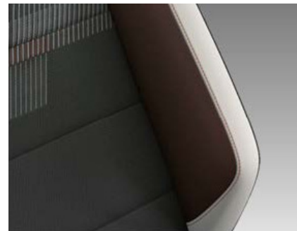
"Diag" (Design Pack Energetic Orange) Orange/Ceramique Cloth (GL) Optional on Style & R-Line