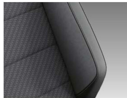
"Carbon Flag" Cloth (R-Line Interior) Crystal Grey (OK) Optional on R-Line