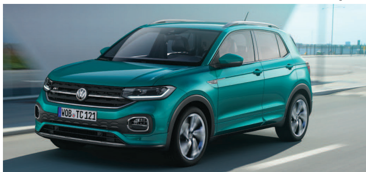
Images show optional interior equipment and 18" Nevada alloy wheel.