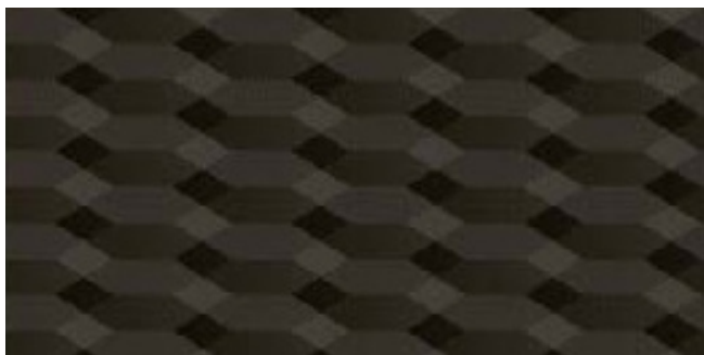
Softell Standard on T-Cross