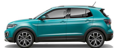
Makena Turquoise Premium Metallic * 0Z0Z

*Optional at extra cost • Please see Options section for pricing information.