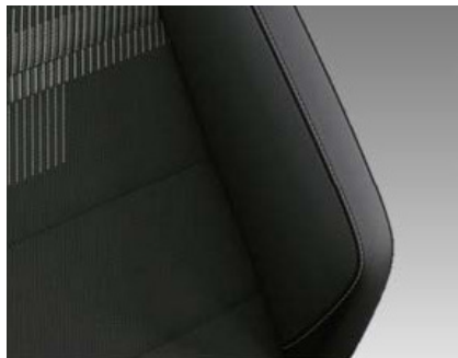
"Diag" (Design Pack Black) Neutral/Titan Black Cloth (UL) Optional on Style & R-Line