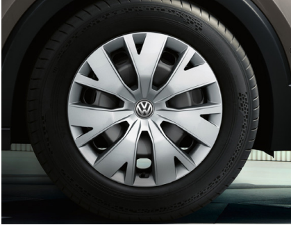
STANDARD ON T-CROSS 16" Dublin steel wheels 6J X 16 Tyres: 205/60 R16

The addition of optional extras may result in the vehicle increasing in Co2 g/km and therefore, attracting a higher rate of VRT than described in this product guide. For your exact configuration value, both Co2 g/km and RRP, please visit volkswagen.ie configurator.