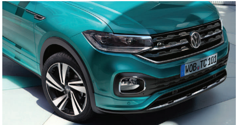
Images show optional interior equipment and 18" Nevada alloy wheel.