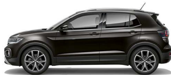
Deep Black Pearl Effect * 2T2T