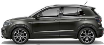
Urano Grey Solid 5K5K Note: not available with R-Line