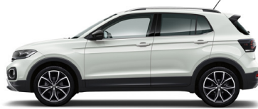
Pure White Solid * 0Q0Q