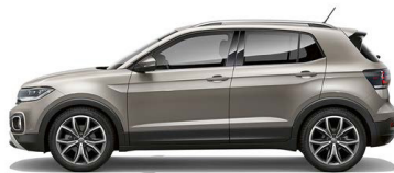
Limestone Grey Metallic * Z1Z1