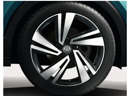
OPTIONAL ON STYLE & R-LINE 18" Nevada alloy wheels with burnished finish 7J X 18 Tyres: 215/45 R18

The addition of optional extras may result in the vehicle increasing in Co2 g/km and therefore, attracting a higher rate of VRT than described in this product guide. For your exact configuration value, both Co2 g/km and RRP, please visit volkswagen.ie configurator.