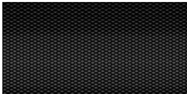
Pinapple Standard on Life