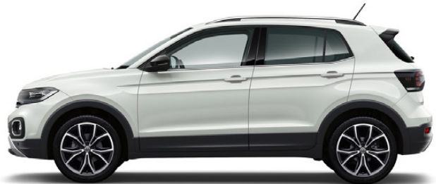
Design Pack: Black