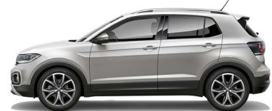
Reflex Silver Metallic * 8E8E