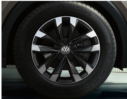
OPTIONAL ON T-CROSS & LIFE 16" Rochester alloy wheels 6J X 16 Tyres: 205/60 R16