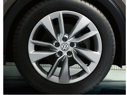
STANDARD ON STYLE 17" Bangalore alloy wheels 6J X 17 Tyres: 205/55 R17