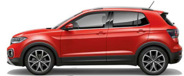
Flash Red Solid * D8D8 Note: not available with R-Line