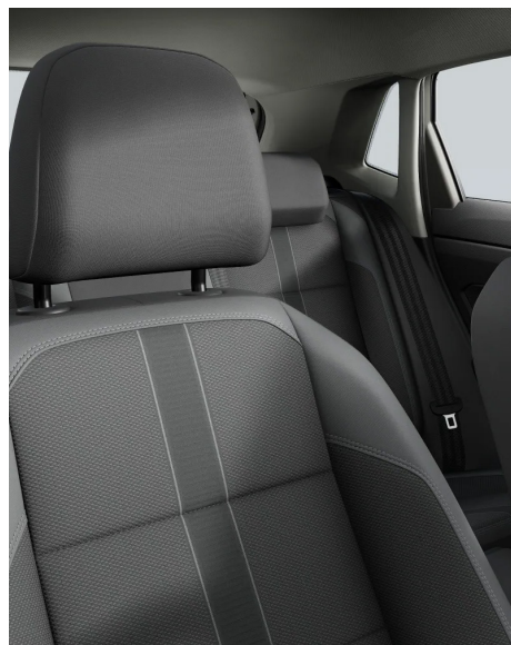
"Tracks" cloth Titan Black (FJ) Standard on Style