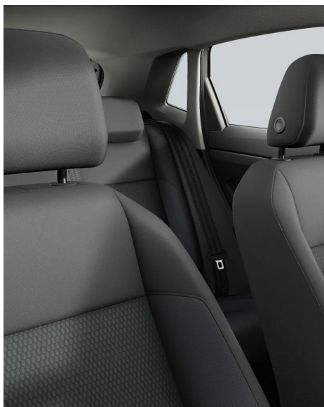
"Slash" cloth Titan Black (EL) Standard on Polo, Life and Edition 75